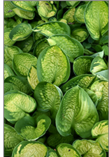
Rainforest Sunrise Hosta foliage