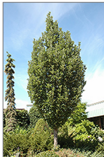
Crimson Spire Oak

Crimson Spire Oak is recommended for the following landscape applications;