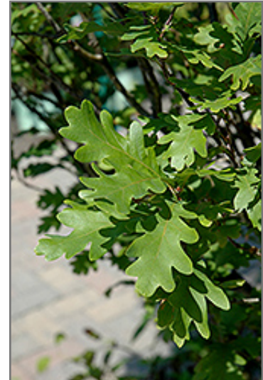
Crimson Spire Oak foliage

This tree should only be grown in full sunlight. It is very adaptable to both dry and moist locations, and should do just fine under average home landscape conditions. It is not particular as to soil type or pH. It is highly tolerant of urban pollution and will even thrive in inner city environments. This particular variety is an interspecific hybrid.