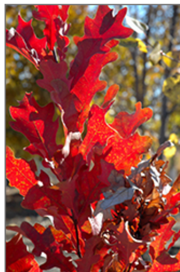
Crimson Spire Oak in fall

10300 E. 9000 N Road Grant Park, IL 60940 Phone: 1-815-465-6310 Fax: 1-815-465-6396