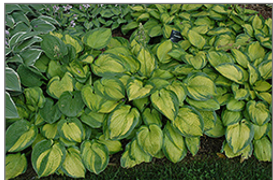
Paradigm Hosta