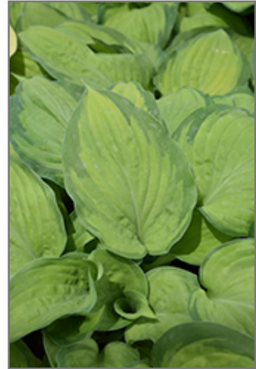
Paradigm Hosta foliage

This plant does best in partial shade to shade. It prefers to grow in average to moist conditions, and shouldn't be allowed to dry out. It is not particular as to soil type or pH. It is somewhat tolerant of urban pollution. This particular variety is an interspecific hybrid. It can be propagated by division; however, as a cultivated variety, be aware that it may be subject to certain restrictions or prohibitions on propagation.