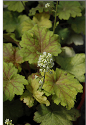
Electra Coral Bells flowers

Electra Coral Bells is recommended for the following landscape applications;