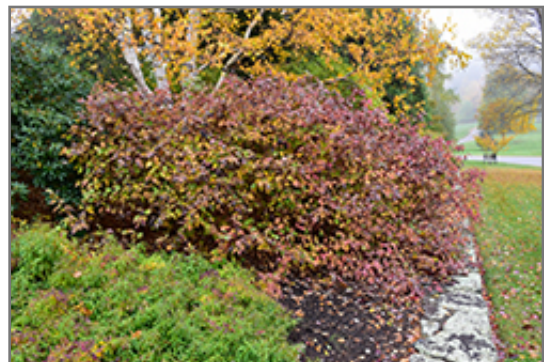
Bailey Red-Twig Dogwood in fall