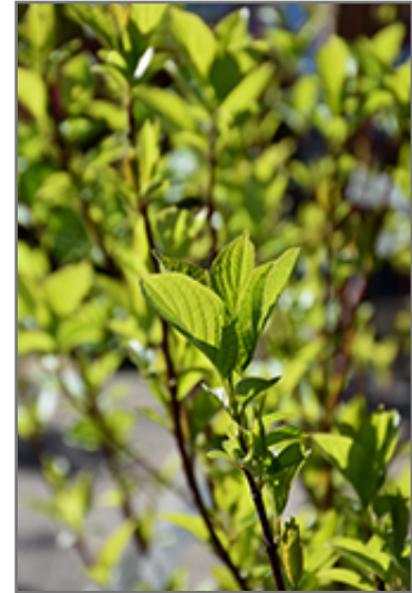
Bailey Red-Twig Dogwood foliage

This shrub does best in full sun to partial shade. It is an amazingly adaptable plant, tolerating both dry conditions and even some standing water. It is not particular as to soil type or pH. It is highly tolerant of urban pollution and will even thrive in inner city environments. This species is native to parts of North America.