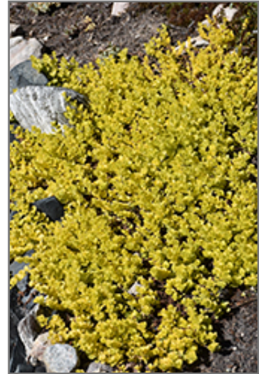
Goldilocks Creeping Jenny

Goldilocks Creeping Jenny will grow to be only 6 inches tall at maturity, with a spread of 3 feet. When grown in masses or used as a bedding plant, individual plants should be spaced approximately 24 inches apart. Its foliage tends to remain low and dense right to the ground. It grows at a fast rate, and under ideal conditions can be expected to live for approximately 10 years. As an herbaceous perennial, this plant will usually die back to the crown each winter, and will regrow from the base each spring. Be careful not to disturb the crown in late winter when it may not be readily seen!