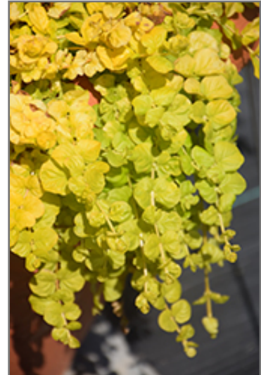
Goldilocks Creeping Jenny foliage