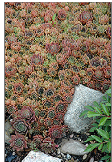
Silverine Hens And Chicks