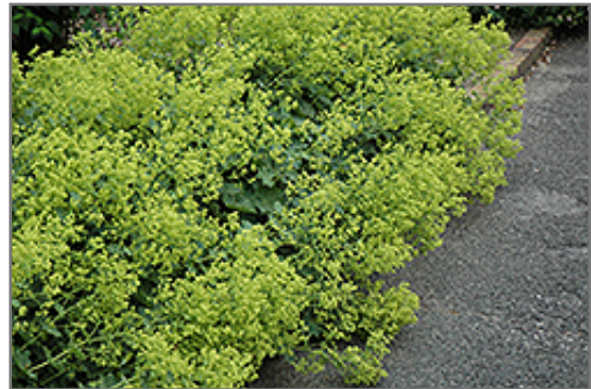
Thriller Lady's Mantle in bloom

Thriller Lady's Mantle is recommended for the following landscape applications;