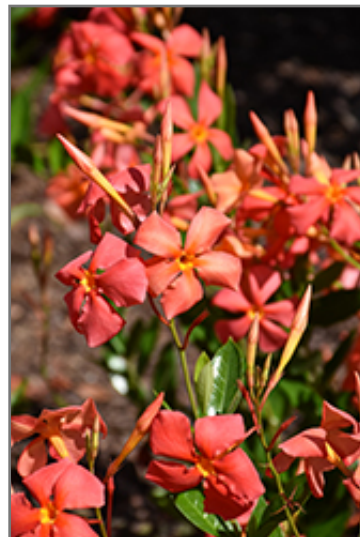
Sun Parasol Fired Up Mandevilla flowers

This plant is native to the tropics and prefers growing in moist environments with evenly warm conditions all year round. In our climate, it is usually grown as an outdoor annual in the garden or in a container. If you want it to survive the winter, it can be brought in to the house and provided with special care, and then returned to the garden the following season. In its preferred tropical habitat, it can grow to be around 8 feet tall at maturity, with a spread of 24 inches. However, when grown as an annual or when overwintered indoors, it can be expected to perform differently, and its exact height and spread will depend on many factors; you may wish to consult with our experts as to how it might perform in your specific application and growing conditions.