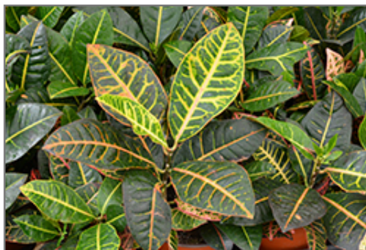
Petra Variegated Croton foliage

Petra Variegated Croton is a fine choice for the garden, but it is also a good selection for planting in outdoor pots and containers. With its upright habit of growth, it is best suited for use as a 'thriller' in the 'spiller-thriller-filler' container combination; plant it near the center of the pot, surrounded by smaller plants and those that spill over the edges. It is even sizeable enough that it can be grown alone in a suitable container. Note that when growing plants in outdoor containers and baskets, they may require more frequent waterings than they would in the yard or garden.