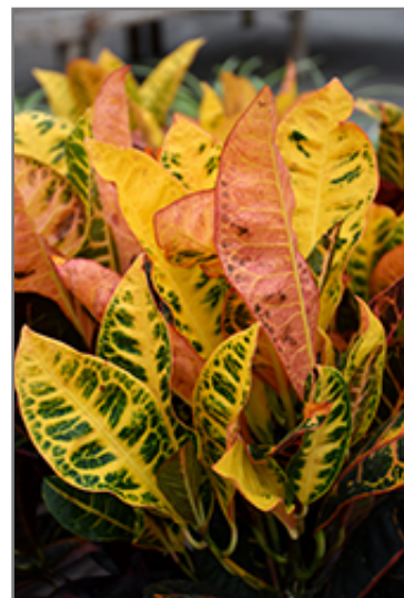
Petra Variegated Croton foliage

10300 E. 9000 N Road Grant Park, IL 60940 Phone: 1-815-465-6310 Fax: 1-815-465-6396