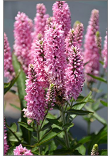
Skyward Pink Long-leaf Speedwell flowers

Skyward Pink Long-leaf Speedwell is a fine choice for the garden, but it is also a good selection for planting in outdoor pots and containers. It is often used as a 'filler' in the 'spiller-thriller-filler' container combination, providing a mass of flowers against which the larger thriller plants stand out. Note that when growing plants in outdoor containers and baskets, they may require more frequent waterings than they would in the yard or garden.