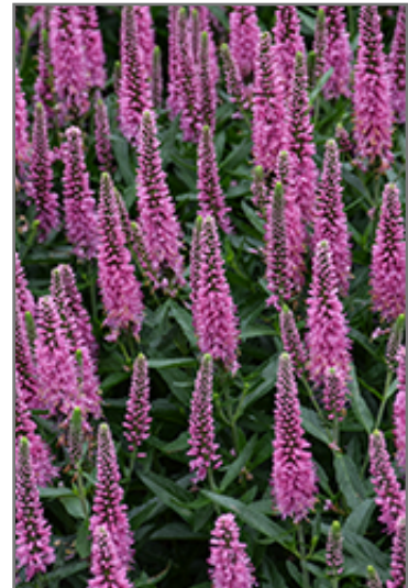
Skyward Pink Long-leaf Speedwell flowers

Skyward Pink Long-leaf Speedwell is recommended for the following landscape applications;