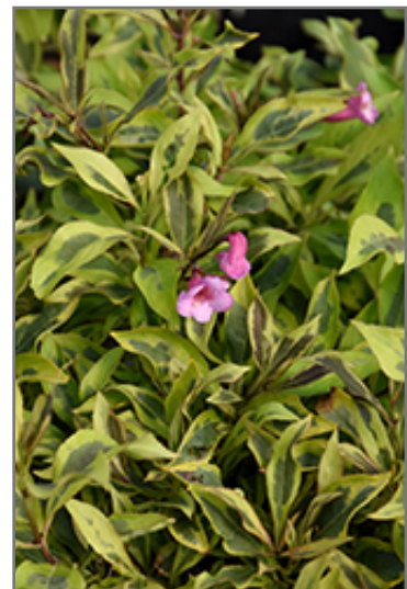
Bubbly Wine Weigela flowers