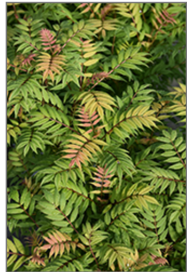
Mr. Mustard False Spirea foliage