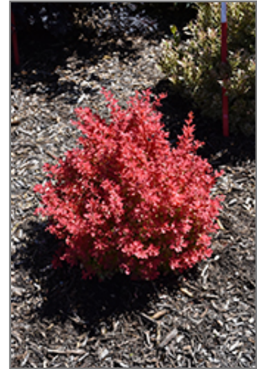
Sunjoy Neo Japanese Barberry

Sunjoy Neo Japanese Barberry makes a fine choice for the outdoor landscape, but it is also well-suited for use in outdoor pots and containers. It can be used either as 'filler' or as a 'thriller' in the 'spiller-thriller-filler' container combination, depending on the height and form of the other plants used in the container planting. It is even sizeable enough that it can be grown alone in a suitable container. Note that when grown in a container, it may not perform exactly as indicated on the tag - this is to be expected. Also note that when growing plants in outdoor containers and baskets, they may require more frequent waterings than they would in the yard or garden.