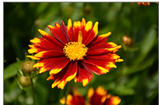
UpTick Red Tickseed flowers