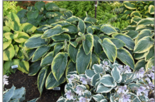
Shadowland Wu-La-La Hosta

Shadowland Wu-La-La Hosta is a dense herbaceous perennial with a mounded form. Its medium texture blends into the garden, but can always be balanced by a couple of finer or coarser plants for an effective composition.