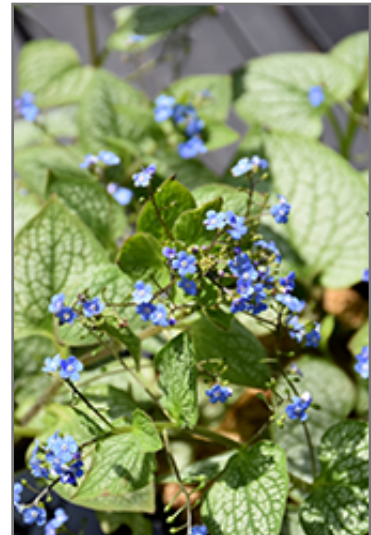
Jack of Diamonds Bugloss flowers

Jack of Diamonds Bugloss is recommended for the following landscape applications;