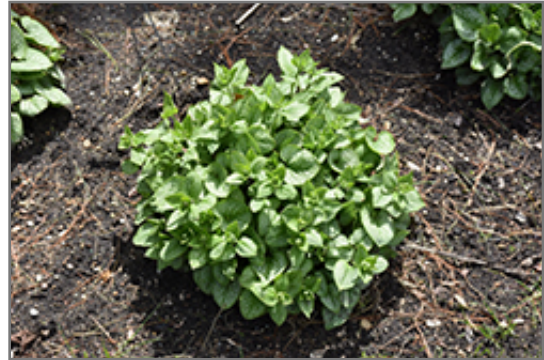
Jack of Diamonds Bugloss

Jack of Diamonds Bugloss will grow to be about 14 inches tall at maturity, with a spread of 30 inches. When grown in masses or used as a bedding plant, individual plants should be spaced approximately 28 inches apart. It grows at a medium rate, and under ideal conditions can be expected to live for approximately 10 years. As an herbaceous perennial, this plant will usually die back to the crown each winter, and will regrow from the base each spring. Be careful not to disturb the crown in late winter when it may not be readily seen!