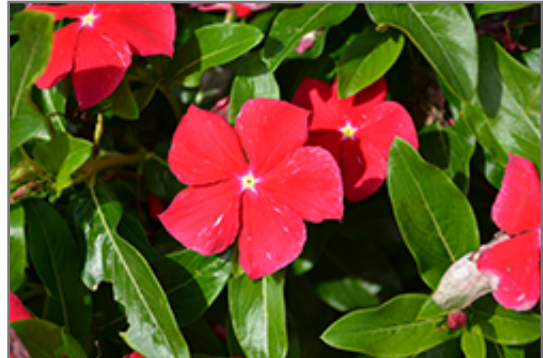
Cora XDR Red Vinca flowers

Cora XDR Red Vinca is recommended for the following landscape applications;