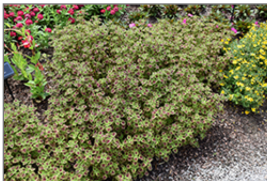
ColorBlaze Chocolate Drop Coleus