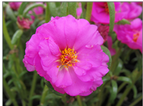
Happy Hour Rosita Portulaca flowers