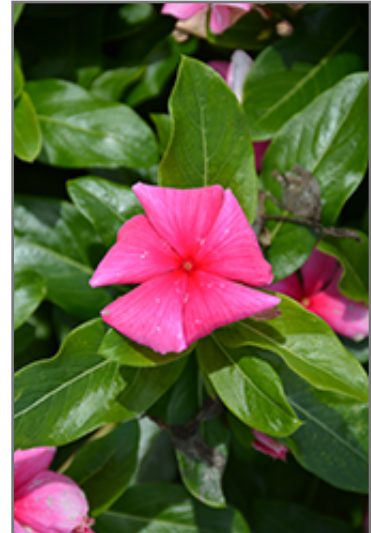
Cora XDR Deep Strawberry flowers

This plant will require occasional maintenance and upkeep, and should not require much pruning, except when necessary, such as to remove dieback. It is a good choice for attracting butterflies to your yard, but is not particularly attractive to deer who tend to leave it alone in favor of tastier treats. It has no significant negative characteristics.