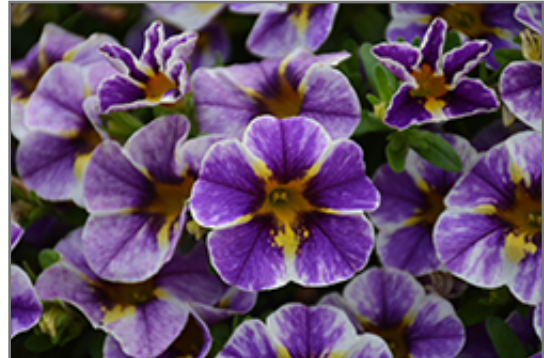
Superbells Holy Smokes! Calibrachoa flowers

Superbells Holy Smokes! Calibrachoa is a dense herbaceous annual with a trailing habit of growth, eventually spilling over the edges of hanging baskets and containers. Its medium texture blends into the garden, but can always be balanced by a couple of finer or coarser plants for an effective composition.