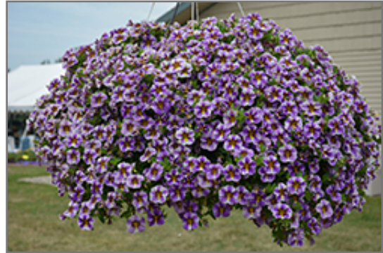
Superbells Holy Smokes! Calibrachoa in bloom