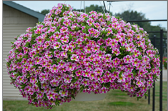
Superbells Holy Cow! Calibrachoa in bloom