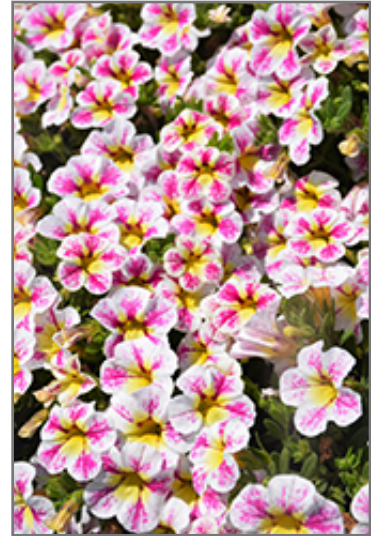
Superbells Holy Cow! Calibrachoa flowers

Superbells Holy Cow! Calibrachoa is a dense herbaceous annual with a trailing habit of growth, eventually spilling over the edges of hanging baskets and containers. Its medium texture blends into the garden, but can always be balanced by a couple of finer or coarser plants for an effective composition.