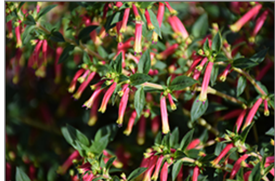
Honeybells Cuphea flowers