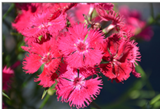
Rockin' Rose Pinks flowers

This is a relatively low maintenance plant, and is best cleaned up in early spring before it resumes active growth for the season. It is a good choice for attracting bees and butterflies to your yard, but is not particularly attractive to deer who tend to leave it alone in favor of tastier treats. It has no significant negative characteristics.