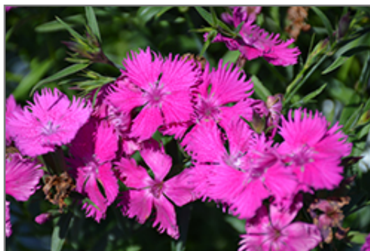
Rockin' Purple Pinks flowers

Rockin' Purple Pinks is an herbaceous evergreen perennial with a mounded form. It brings an extremely fine and delicate texture to the garden composition and should be used to full effect.