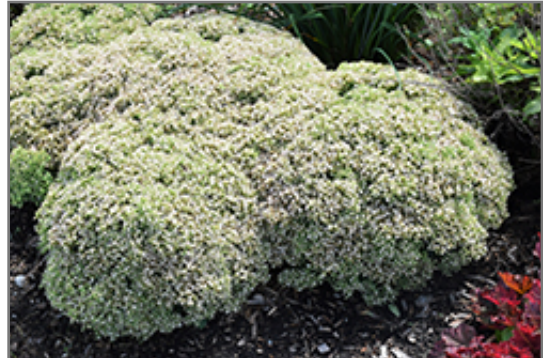
Rock 'N Round Bundle Of Joy Stonecrop in bloom

Rock 'N Round Bundle Of Joy Stonecrop is a dense herbaceous perennial with a mounded form. Its medium texture blends into the garden, but can always be balanced by a couple of finer or coarser plants for an effective composition.