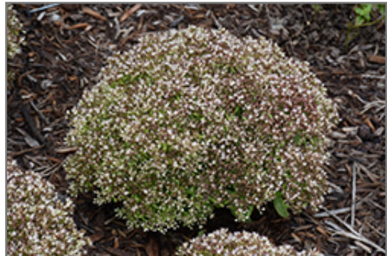
Rock 'N Round Bundle Of Joy Stonecrop in bloom