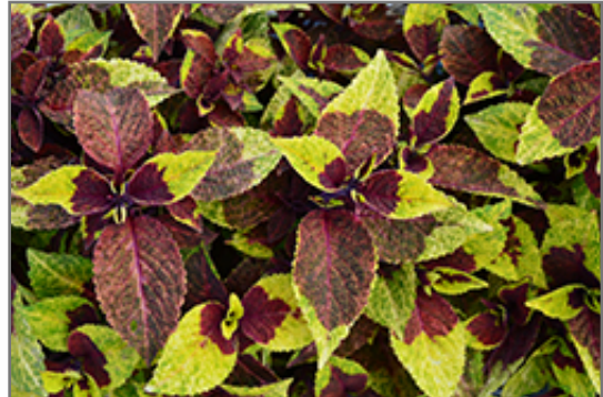
Premium Sun Pineapple Surprise Coleus foliage

Premium Sun Pineapple Surprise Coleus is recommended for the following landscape applications;