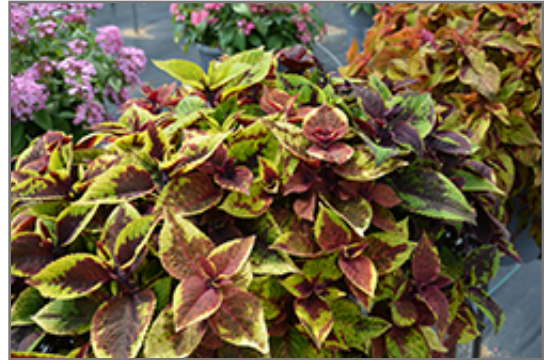
Premium Sun Pineapple Surprise Coleus

Premium Sun Pineapple Surprise Coleus will grow to be about 24 inches tall at maturity, with a spread of 20 inches. When grown in masses or used as a bedding plant, individual plants should be spaced approximately 18 inches apart. Although it's not a true annual, this fast-growing plant can be expected to behave as an annual in our climate if left outdoors over the winter, usually needing replacement the following year. As such, gardeners should take into consideration that it will perform differently than it would in its native habitat.