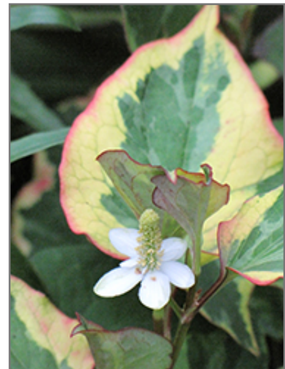
Chameleon Houttuynia flowers