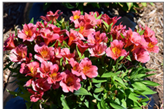
Colorita Eliane Alstroemeria in bloom