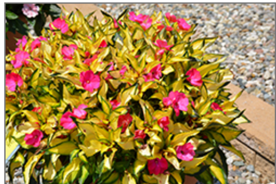
SunPatiens Compact Tropical Rose New Guinea Impatiens in bloom