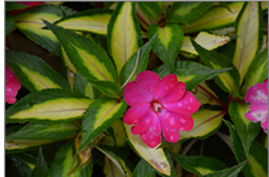
SunPatiens Compact Tropical Rose New Guinea Impatiens flowers