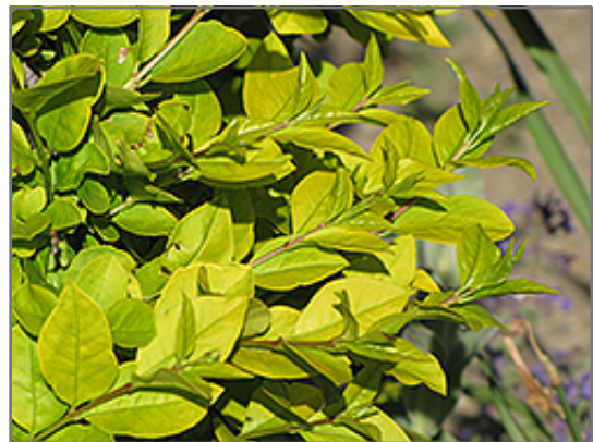
Golden Privet foliage