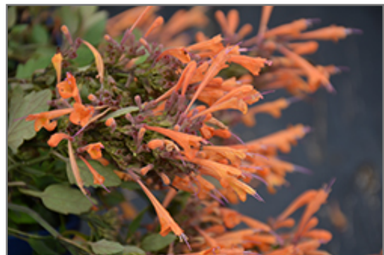
Kudos Mandarin Hyssop flowers