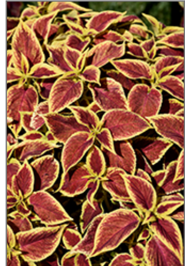
Premium Sun Crimson Gold Coleus foliage

This is a relatively low maintenance plant. The flowers of this plant may actually detract from its ornamental features, so they can be removed as they appear. Deer don't particularly care for this plant and will usually leave it alone in favor of tastier treats. It has no significant negative characteristics.