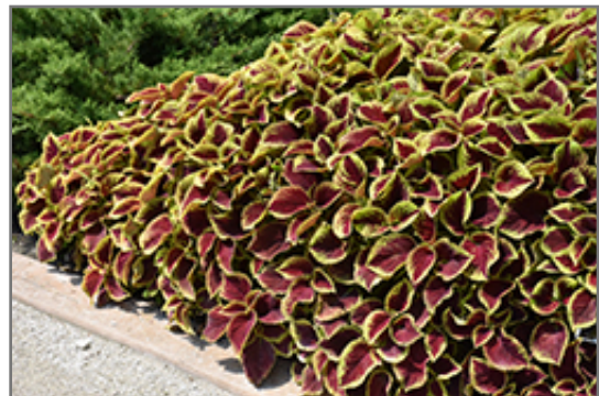
Premium Sun Crimson Gold Coleus