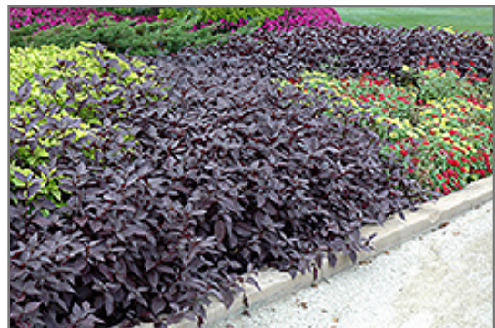
Purple Knight Alternanthera