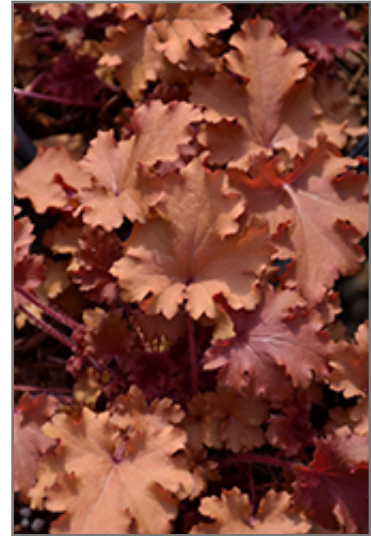
Peach Crisp Coral Bells foliage

Peach Crisp Coral Bells will grow to be about 14 inches tall at maturity extending to 20 inches tall with the flowers, with a spread of 18 inches. When grown in masses or used as a bedding plant, individual plants should be spaced approximately 15 inches apart. Its foliage tends to remain dense right to the ground, not requiring facer plants in front. It grows at a medium rate, and under ideal conditions can be expected to live for approximately 10 years. As an evergreen perennial, this plant will typically keep its form and foliage year-round.