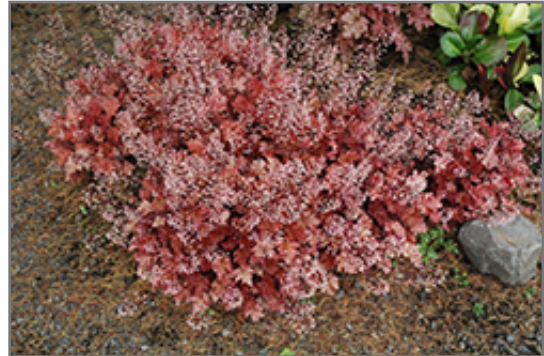
Peach Crisp Coral Bells in bloom

This is a relatively low maintenance plant, and should be cut back in late fall in preparation for winter. It is a good choice for attracting hummingbirds to your yard. It has no significant negative characteristics.