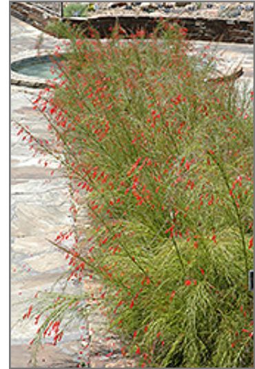
Firecracker Plant in bloom

Firecracker Plant is a fine choice for the garden, but it is also a good selection for planting in outdoor containers and hanging baskets. Because of its height, it is often used as a 'thriller' in the 'spiller-thriller-filler' container combination; plant it near the center of the pot, surrounded by smaller plants and those that spill over the edges. It is even sizeable enough that it can be grown alone in a suitable container. Note that when growing plants in outdoor containers and baskets, they may require more frequent waterings than they would in the yard or garden.