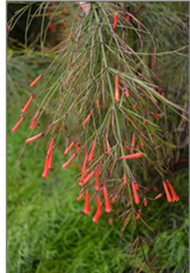
Firecracker Plant flowers