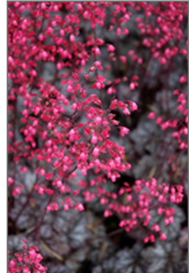
Glitter Coral Bells flowers

Glitter Coral Bells is a fine choice for the garden, but it is also a good selection for planting in outdoor pots and containers. It is often used as a 'filler' in the 'spiller-thriller-filler' container combination, providing a mass of flowers and foliage against which the larger thriller plants stand out. Note that when growing plants in outdoor containers and baskets, they may require more frequent waterings than they would in the yard or garden.