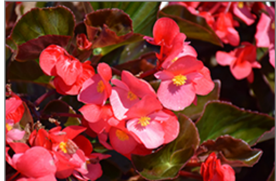
Whopper Rose Bronze Leaf Begonia flowers

This is a high maintenance plant that will require regular care and upkeep, and usually looks its best without pruning, although it will tolerate pruning. Deer don't particularly care for this plant and will usually leave it alone in favor of tastier treats. Gardeners should be aware of the following characteristic(s) that may warrant special consideration;