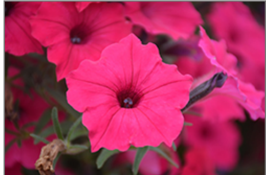
Supertunia Vista Fuchsia Petunia flowers

Supertunia Vista Fuchsia Petunia is recommended for the following landscape applications;