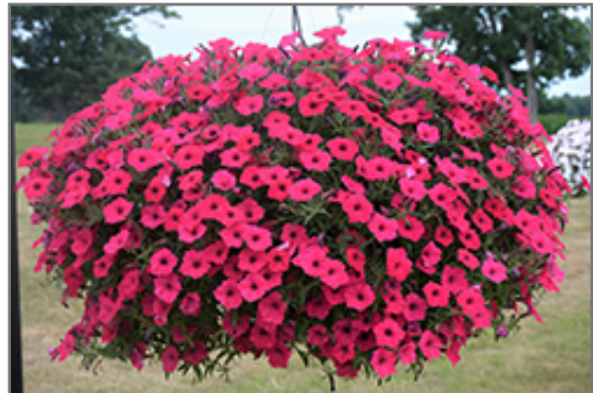
Supertunia Vista Fuchsia Petunia in bloom