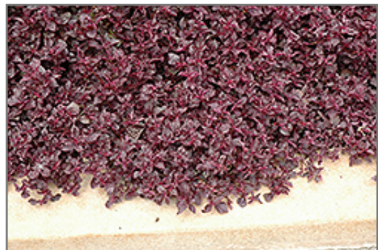
Purple Lady Blood Leaf