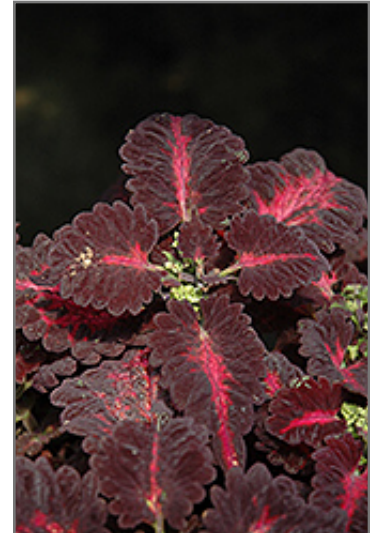
Black Dragon Coleus foliage