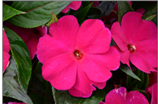
Magnum Purple New Guinea Impatiens flowers

Magnum Purple New Guinea Impatiens is recommended for the following landscape applications;