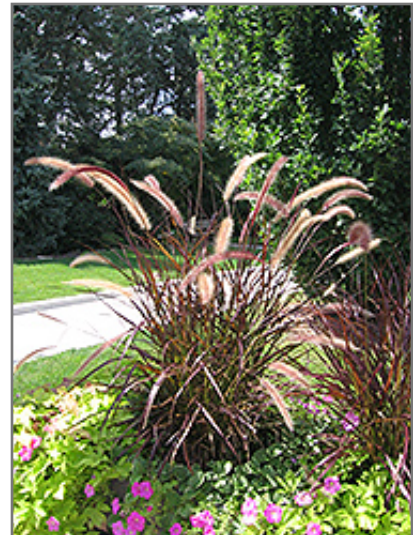
Purple Fountain Grass flowers

Purple Fountain Grass is recommended for the following landscape applications;