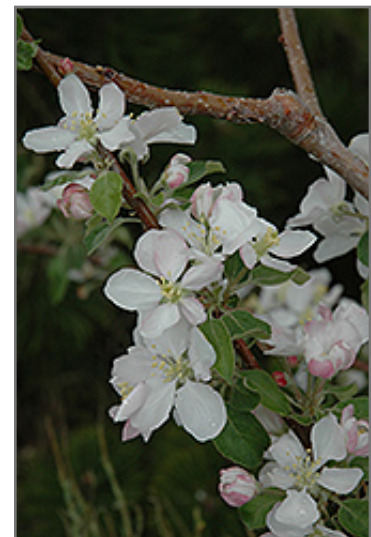
Pink Lady Apple flowers