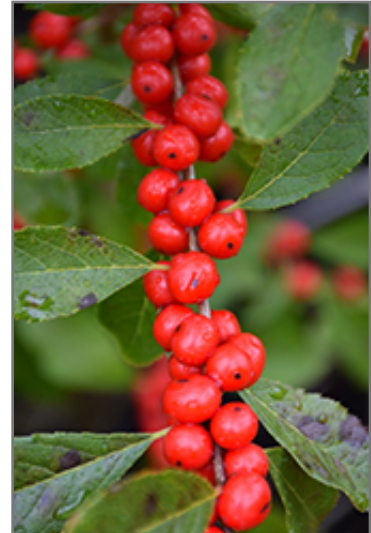
Red Sprite Winterberry fruit