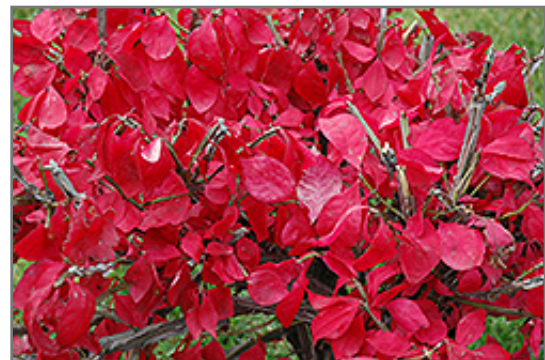
Compact Winged Burning Bush in fall