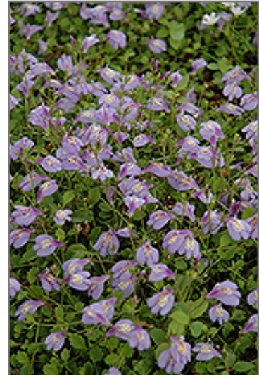
Creeping Mazus flowers