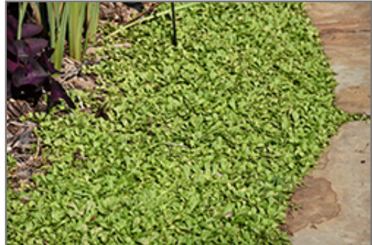
Creeping Mazus

Creeping Mazus is a fine choice for the garden, but it is also a good selection for planting in outdoor pots and containers. Because of its spreading habit of growth, it is ideally suited for use as a 'spiller' in the 'spiller-thriller-filler' container combination; plant it near the edges where it can spill gracefully over the pot. Note that when growing plants in outdoor containers and baskets, they may require more frequent waterings than they would in the yard or garden.