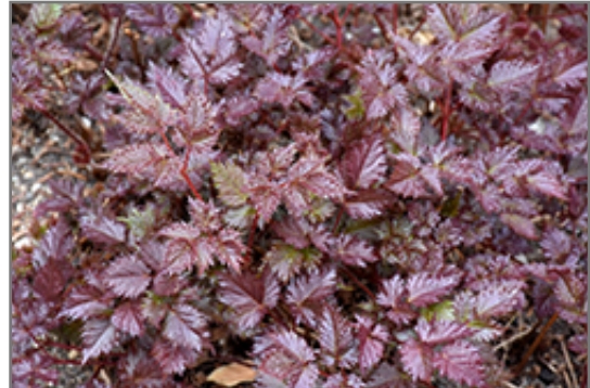
Delft Lace Astilbe foliage