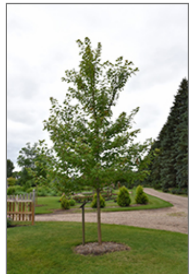
Matador Maple